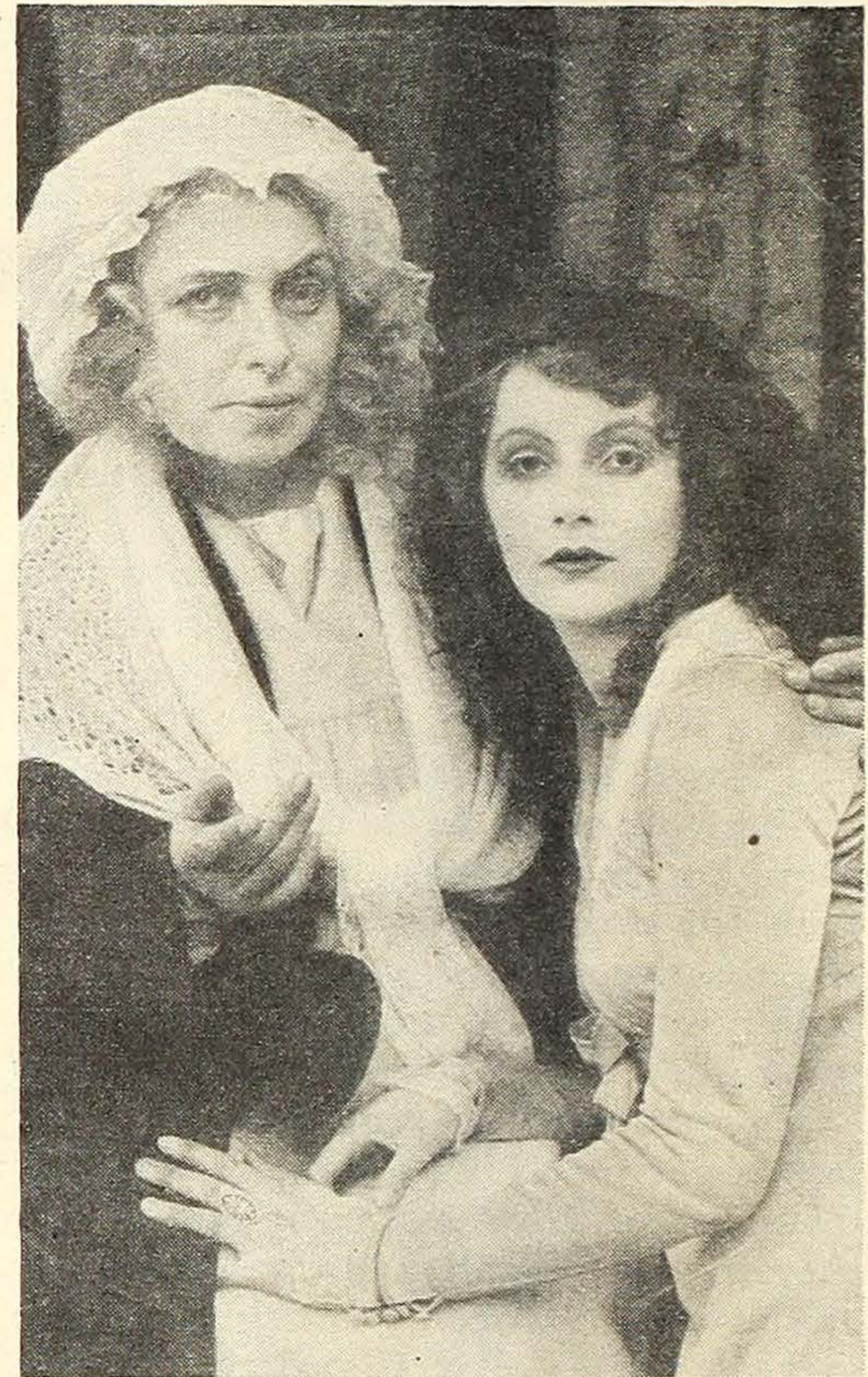
Above, the Gorgeous Garbo as she looked in her pre-Hollywood days—the same heavy-lidded eyes, fascinating mouth, and general aloof expression—but still somewhat naïve, with those curls and all! This scene shows Greta with another actress in one of her early Swedish rôles.