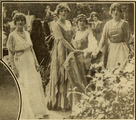
A group of English noblewomen as they appear in the picture. At left is Lily Elsie. Then appears Lady Diana Manners and at extreme right Mrs. John Lavery.

G RIFFITH is the greatest man in pictures, because he lets everybody else do everything they can, and then goes them one better. "Masks and Faces" was produced in England, and it had almost all the stage and screen notables of Great Britain in the cast. What does Griffith do? The most beautiful women of the exclusive court circles act in his picture, "The Great Love." This is the picture recently referred to in PHOTOPLAY , in which Griffith will show the regeneration of British society through its war activities.