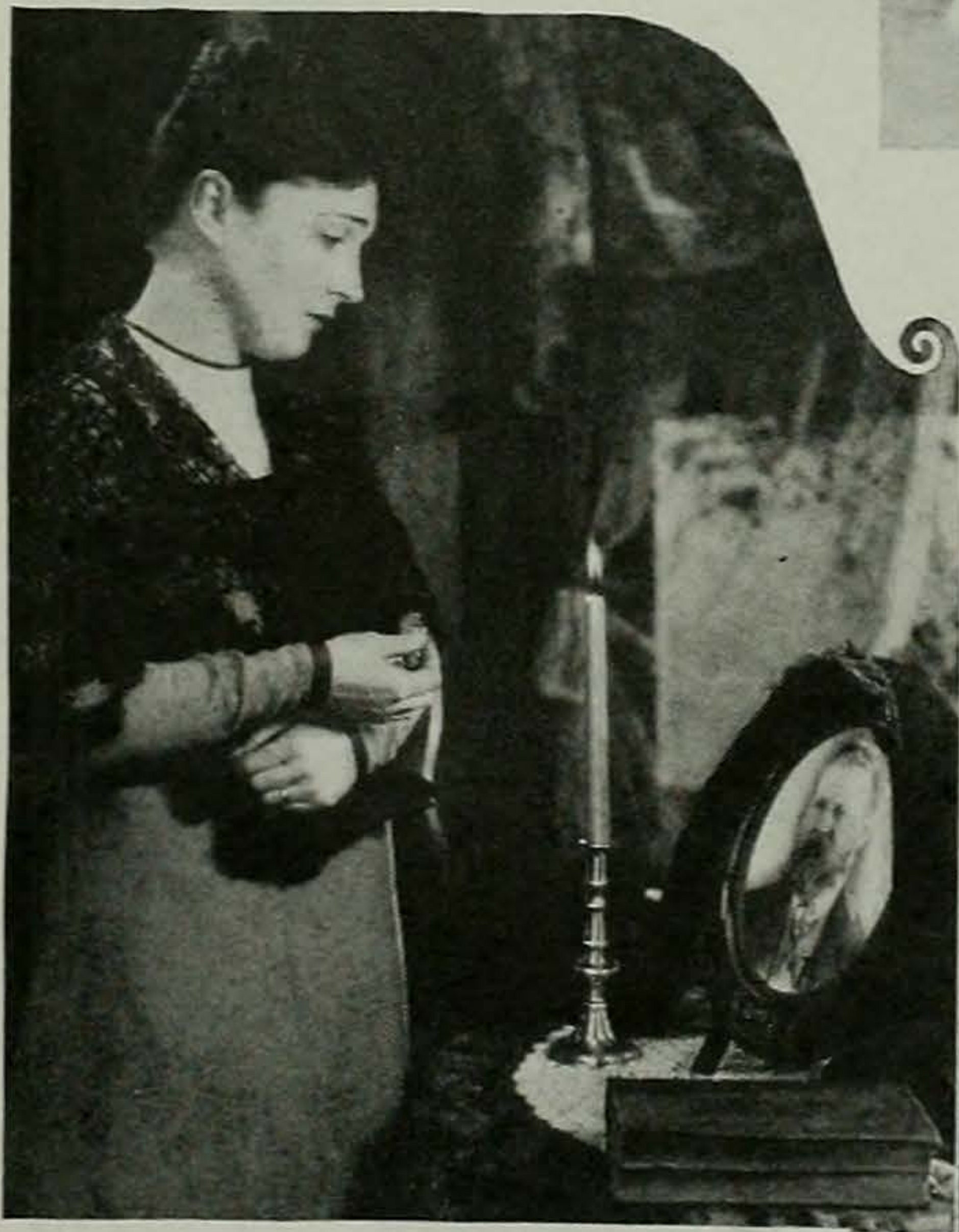
Here is a picture of the life of the German immigrant, with its industry, its stern religion and its deep family sentiment